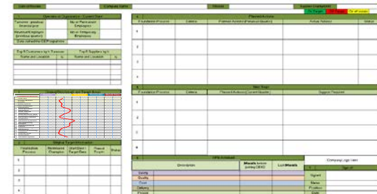
Quarterly (A3) Progress Report