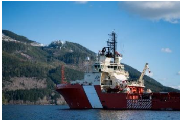
The Atlantic Eagle, near Quatsino Sound, British Columbia in March 2019. The vessel has been stationed in BC coastal waters since December 2018.